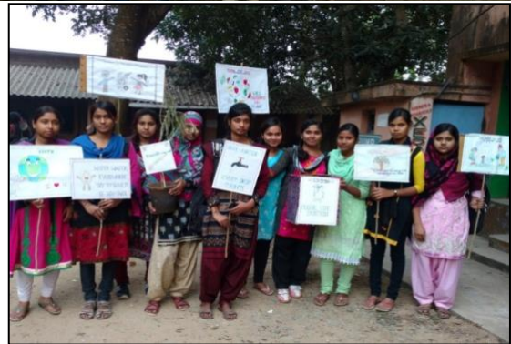
Fig 3: Promotion of Saving Water Resources by students