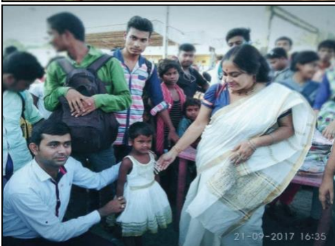
Fig 5: Cloth distribution programme at Tarakeswar Railway Station