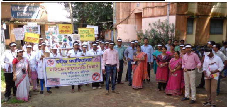
Fig. 4: Dengue awareness programme