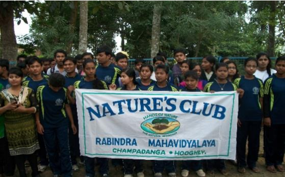
Fig 2: Cleaning of college campus by Nature's Club