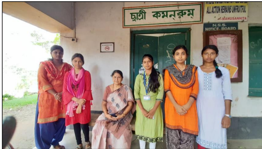
Fig 6: Girl students in front of Girls' Common Room with Lady Attendant

The need of the day is more girls toilet and washrooms within the college premises. Due to insufficient financial resource the inadequate infrastructure facility cannot be improved by college authority.