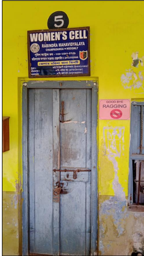
Fig 8: Women's Cell