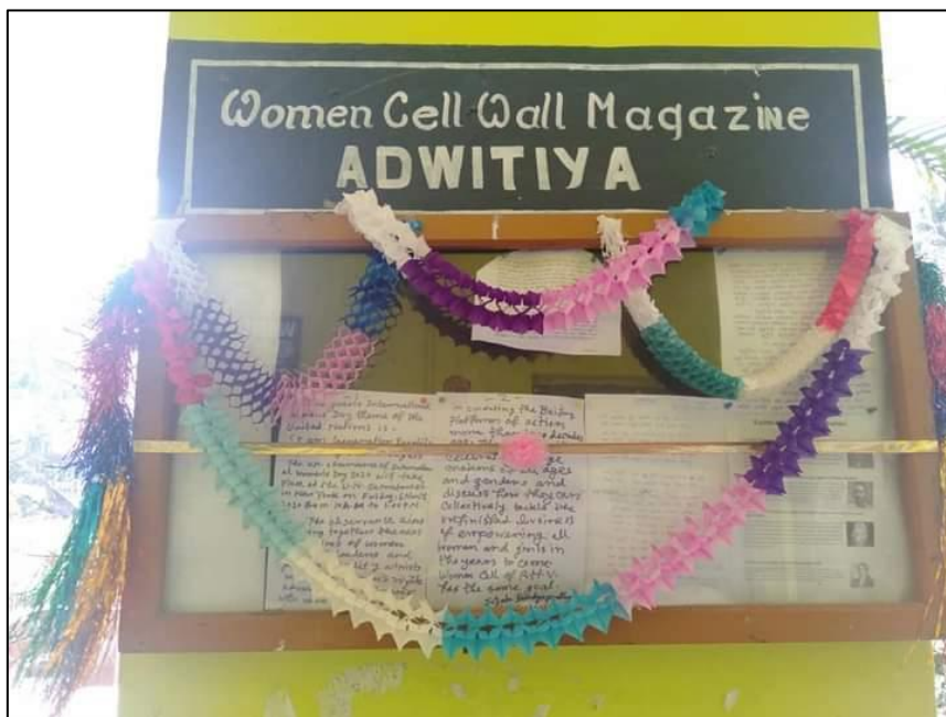
Fig 7: Publication of women's Cell wall magazine 'ADWITIYA'