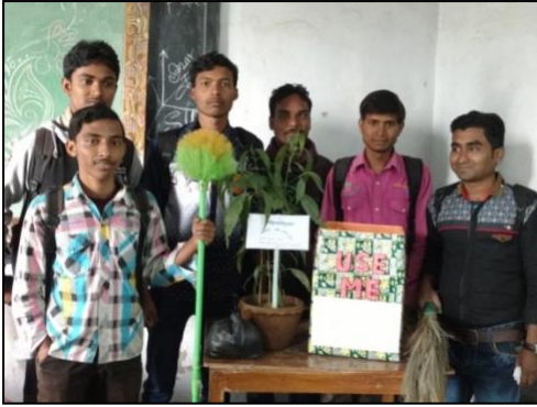
Fig 1: Submission of handmade dustbins from used cartons and medicinal plants by students